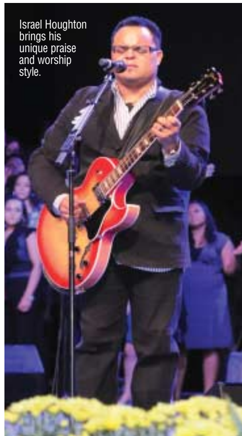
Israel Houghton brings his unique praise and worship style.

Just before business came to a close, a motion for reconsideration was made on the issue of women in ministry. This issue, which provided some of the most engaging debate of the week from both sides of the issue, will be reopened in the Friday morning business session.