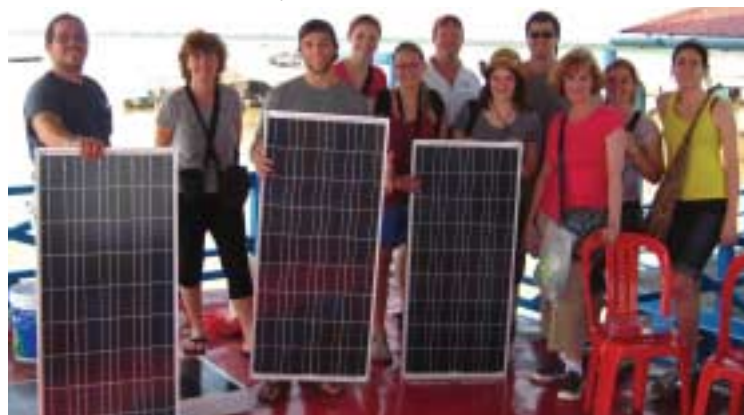
Lee students and faculty members display solar panels to be installed on the Tonle Sap barge.

As the students, with support from the Department of Business, embark on an eventful journey to change lives in Cambodia one family at a time, their project seeks to enact St. Francis of Assisi's compelling charge to all Christians: "Preach the gospel at all times, and when necessary, use words."