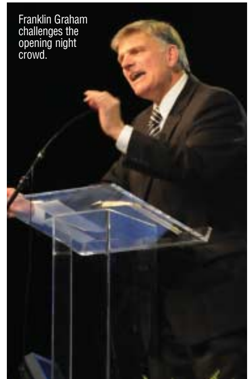
Franklin Graham challenges the opening night crowd.